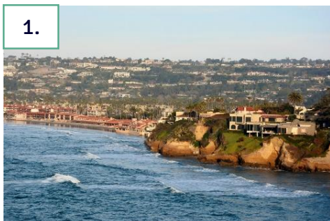
San Diego, the US

3. Look at the photos 1-6 1 and do the tasks below.