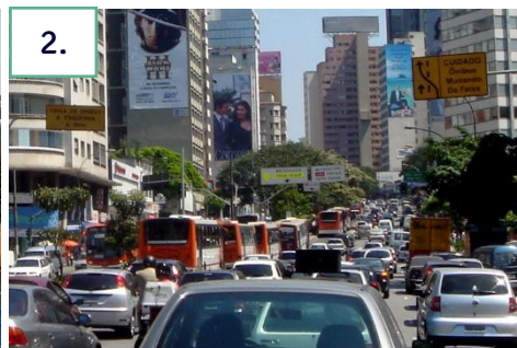
São Paulo, Brazil